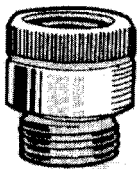
HOSE BIBB VACUUM BREAKER

This means equipping each outside hose connection and hose connections in the basement and laundry room with a simple and inexpensive vacuum breaker. These devices can be obtained from hardware stores or plumbing shops for under $10 each. In other instances, more elaborate protective devices may be necessary. For those situations, assistance in determining what device is appropriate may be needed.